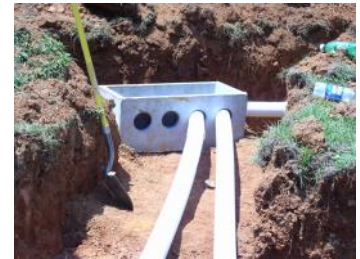
New Distribution Box

Funding is provided by DCR through the Environmental Protection Agency’s 319 Grant. Cost-share funding. The District is offering financial assistance for septic maintenance and repairs to residents of the Slate River and Rock Island Creek watersheds in Buckingham County in an effort to reduce pollution from failing septic systems. Applicants can receive up to 50% assistance, and some applicants may be eligible for up to 80% assistance based on income. Grant PO #16688 will be extended to September 30, 2021. This project has been funded wholly or in part by the U.S. EPA and the VA Department of Environmental Quality under a Section 319 grant agreement to the Peter Francisco SWCD.