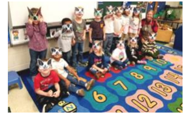
Pollinator Programs at Buckingham Preschool