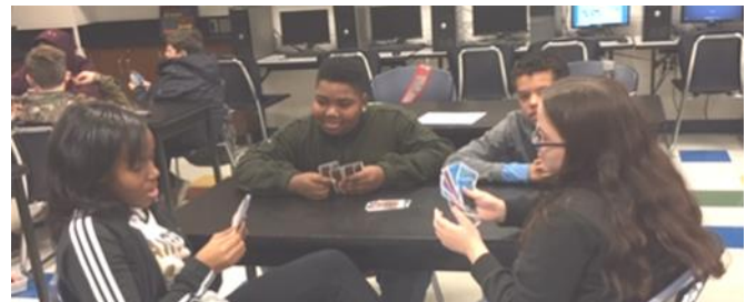
7 th Grade Students at Cumberland County Middle School learn about soil food web trophic levels by playing a go-fish card game