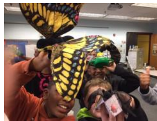
Pollinator Programs at Cumberland Elementary