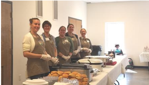
Peter Francisco SWCD Staff, Directors & Associate Directors served the meal at the Area V Spring Meeting